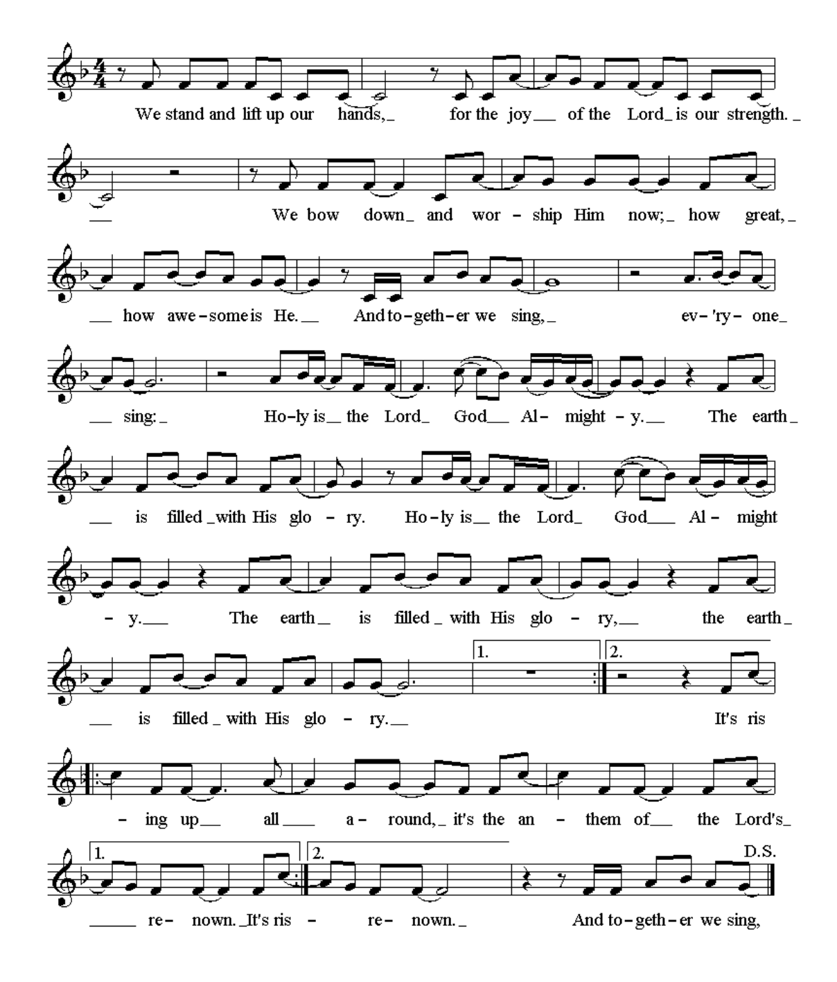
copyright 2003 worshiptogether.com Songs | sixsteps Music (ASCAP) | admin. at EMICMGPublishing.com CCLI #87998